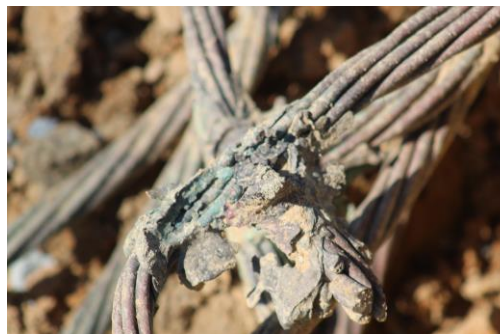
Recently discovered failed exothermic connections