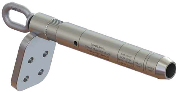
Transmission & Distribution Connectors