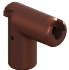
Substation Below Ground Connectors