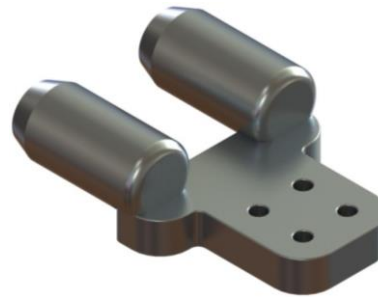
Substation Cable Connectors

DMCPOWER Swage Connectors have been in service for over 30 YEARS with NO REPORTED FAILURES!